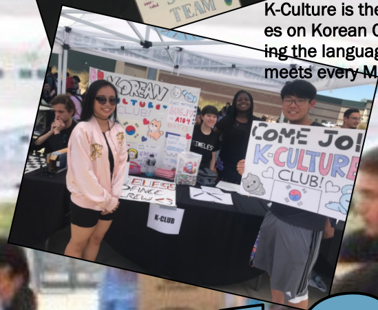
K-Culture is the club that focuses on Korean Culture and learning the language. The club meets every Monday in A104.