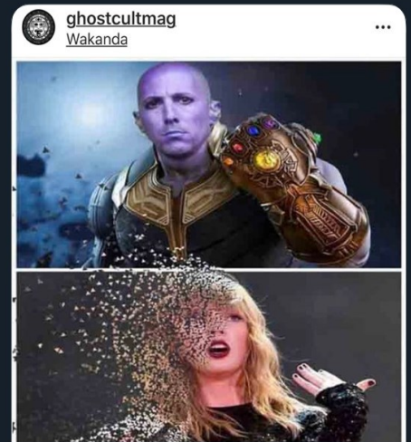
Tool lead singer Maynard J Keenan pokes fun of Taylor Swift on his Twitter after Tool's album knocks her off the charts.

Heh. #comedyfirstandalways #lightenuporjogon @taylorswift13 @puscifer @Tool