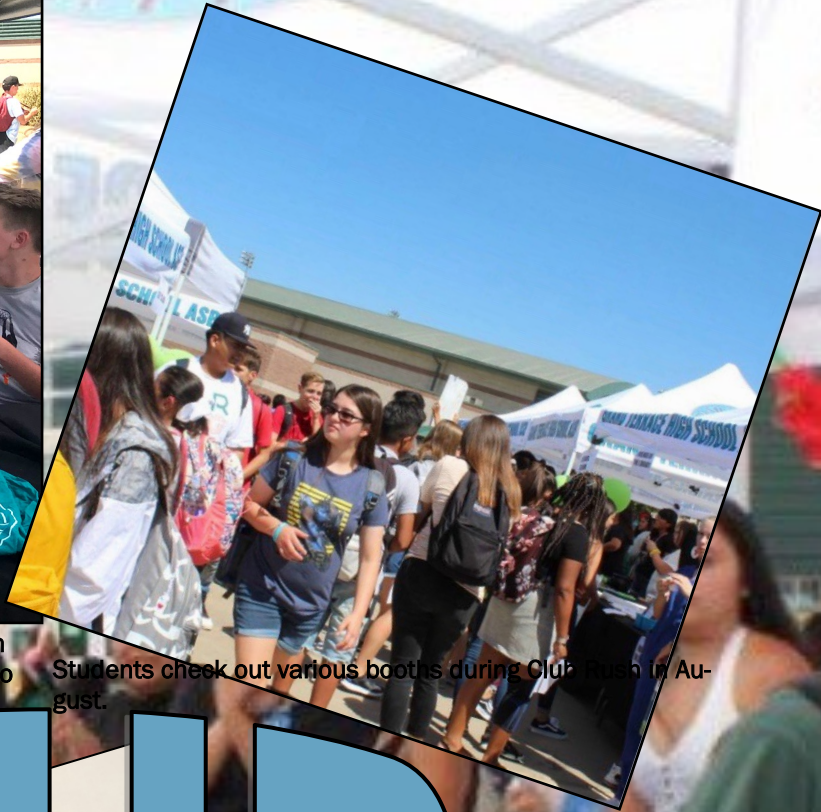
Students check out various booths during Club Rush in August.