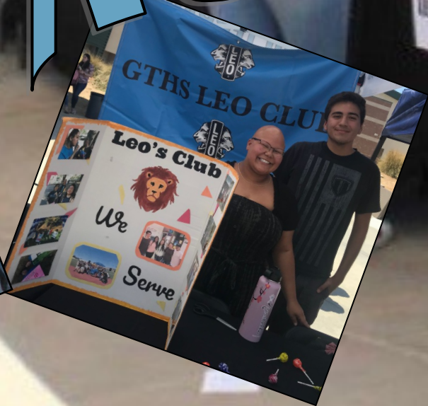
Leo's Club does volunteer activities for the community. Here they show the many activities they do in Grand Terrace.