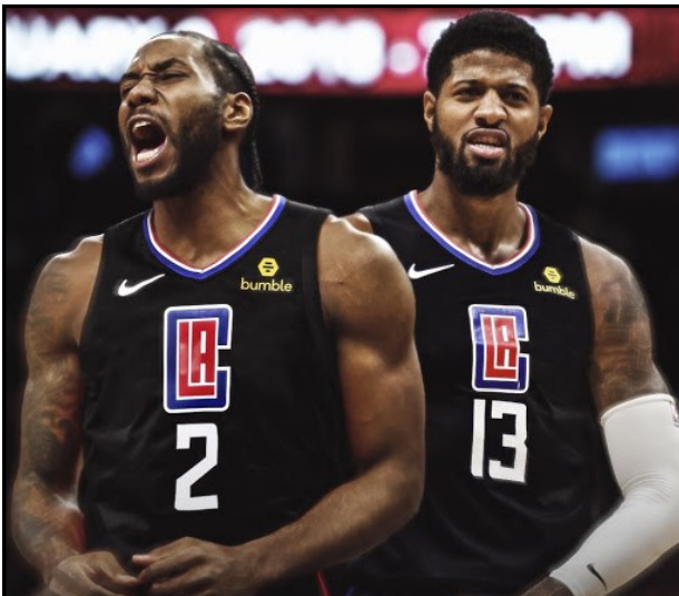
Clippers signed Kawhi Leonard (left) and Paul George.

TITAN TOWN - As of July 7, 2019 the Los Angeles Clippers made a huge trade that involved the superstars Kawhi Leonard and Paul George. Paul George played with the Oklahoma City Thunder and was also nominated for the NBA MVP and the defensive player of the year. Kawhi Leonard is a former player with the Toronto Raptors, where he led them to their first championship in 2019 and also where he won the NBA Finals MVP.