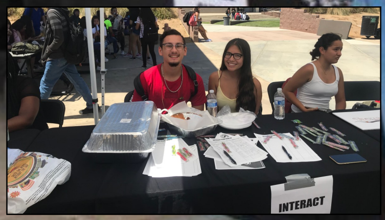
Interact performs volunteer activities for the community.