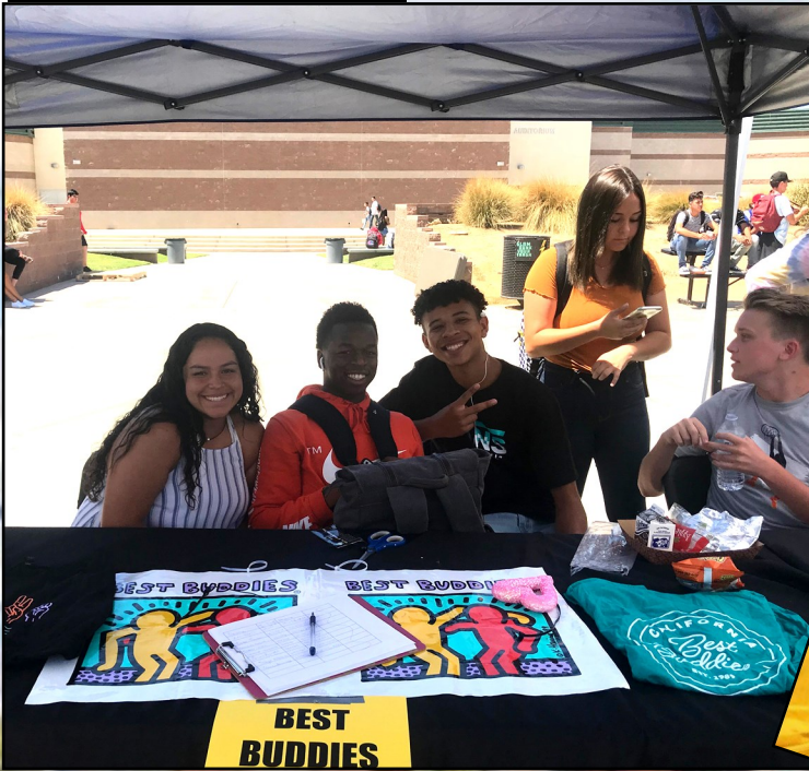
Best Buddies is a club that meets during lunch and eats lunch with the special needs students on campus. It is a great way to make new friends., members say.