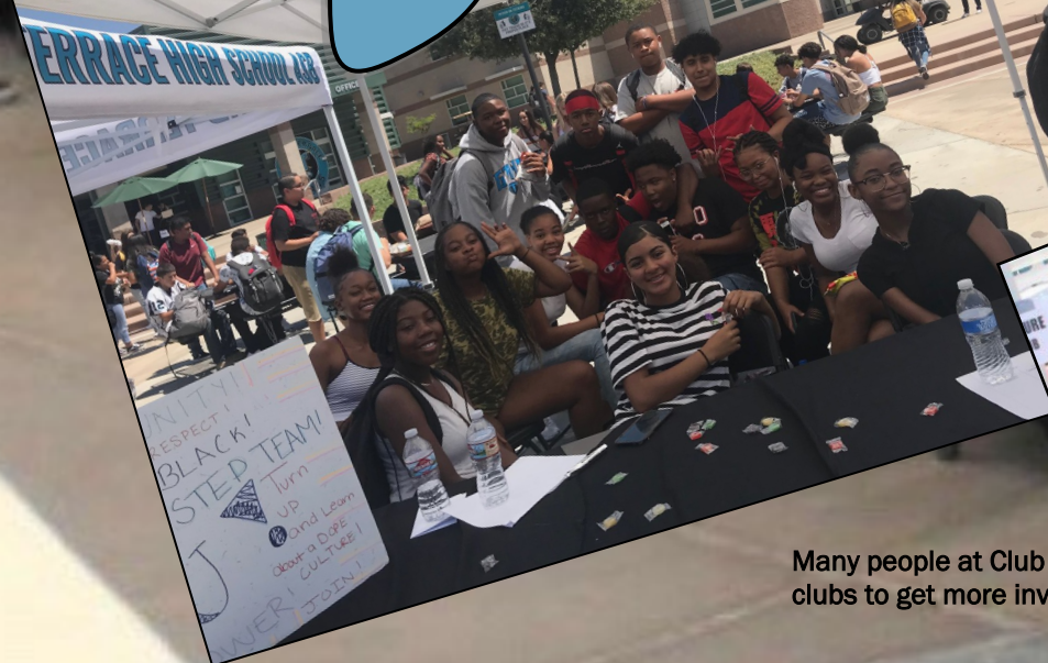
The Black Student Union promotes their club, which seeks to gain knowledge about Black culture, perform charity and organize the BSU Showcase.