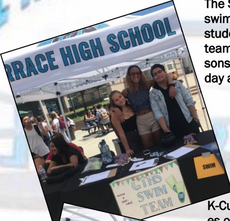
The Swim Team promotes swim lessons and encourages students to join the swim team. They have the swim lessons every Tuesday and Thursday at the swimming pool.