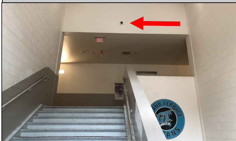
A camera atop the stairwell of the A Building is recording activity.