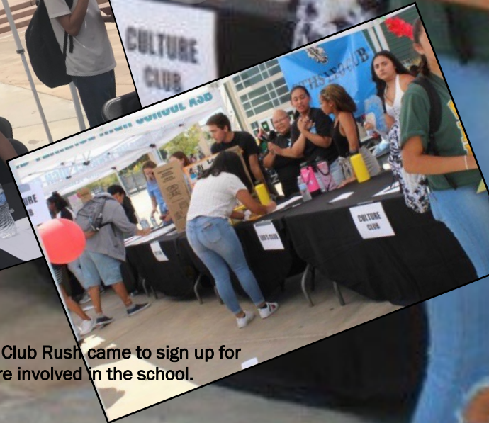
Many people at Club Rush came to sign up for clubs to get more involved in the school.