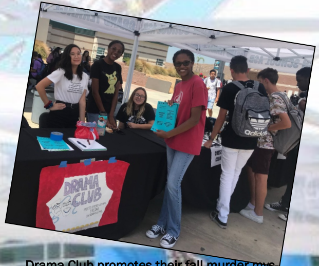
Drama Club promotes their fall murder mystery coming up this month and encourage students to sign up and audition. They have meetings every other Friday in room G742.